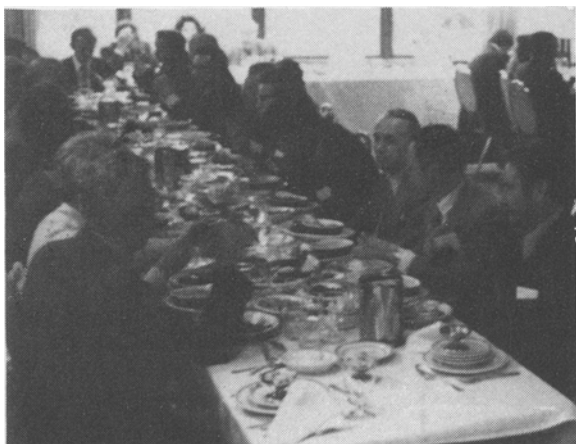
Dinner at the Ladies' Night Meeting of the AOCS Northeast Section.